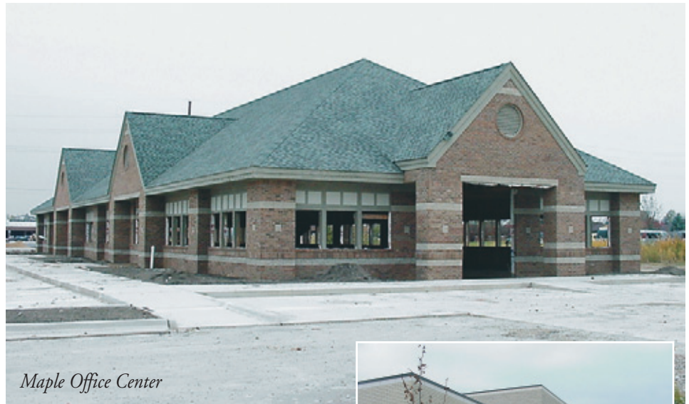
Maple Office Center