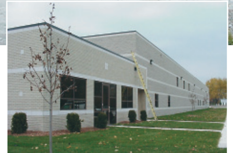
Painters & Allied Trades–District Council 22

Special features: High-end finishes, 12-foot ceilings, custom millwork, glass doors throughout.